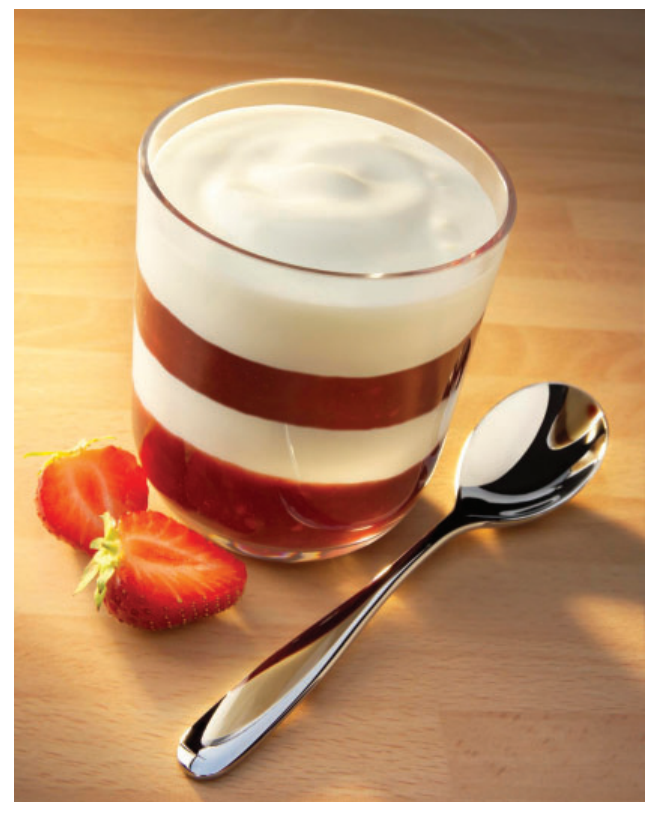
A fruit preparation was one of the applications chosen for this study. Samples were tested at ambient, frozen and refrigerated conditions for a specified period of time.

The research objective accounted for this complexity. The aim of the project was to gain the most comprehensive understanding yet of functional native starch's stability across different applications and storage conditions. Through this knowledge, manufacturers will be able to achieve stability in clean label products, by selecting the appropriate functional native starch.