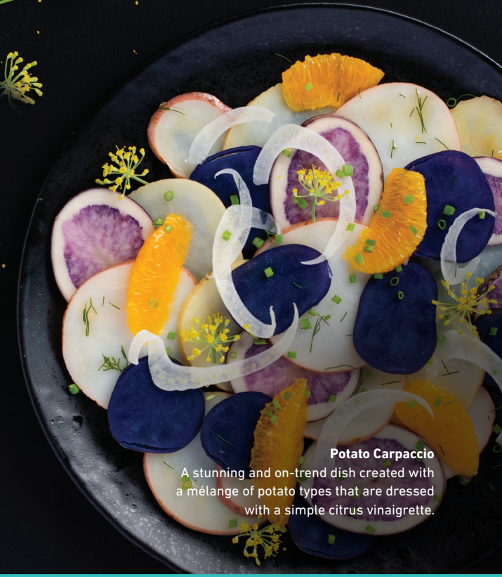
Potato Carpaccio A stunning and on-trend dish created with a mélange of potato types that are dressed with a simple citrus vinaigrette.

As the race picks up steam and more products and brands come to market, SRG's culinary trend translators are here to help you navigate the plant landscape and ID ways to stay ahead of the curve and on the leading edge of what's next.