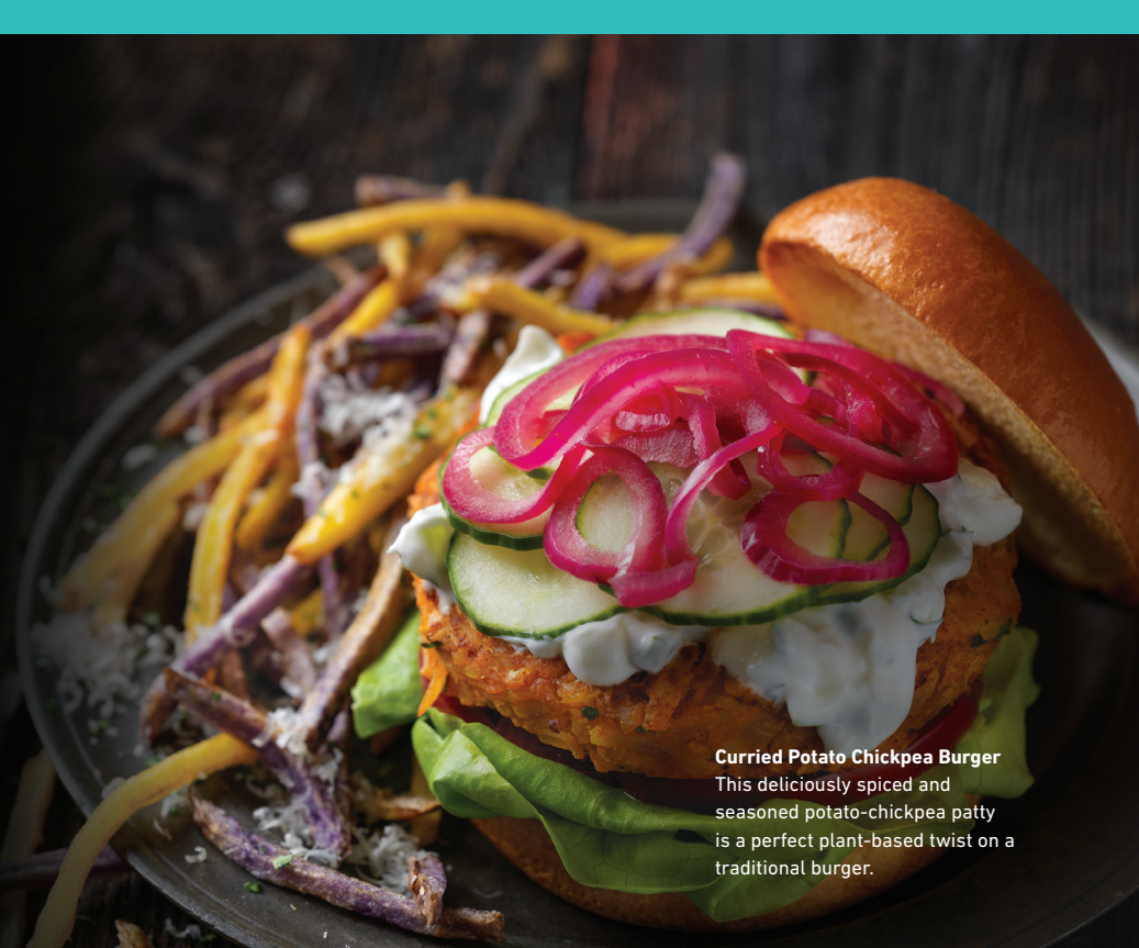
Curried Potato Chickpea Burger This deliciously spiced and seasoned potato-chickpea patty is a perfect plant-based twist on a traditional burger.

Headquartered in Boulder, Colorado, SRG is a nationally recognized brand consultancy and creative agency. The agency has expertise in consumer insights, brand strategy and positioning, new product innovation, advertising, and design. With deep experience in all things consumer and culinary, it is responsible for $10 billion in incremental value for clients over the past five years alone. SRG has been ranked on Outside Magazine's Best Places to Work list for the past nine years and was also recognized by Ad Age as a 2016 and 2017 Best Place to Work.